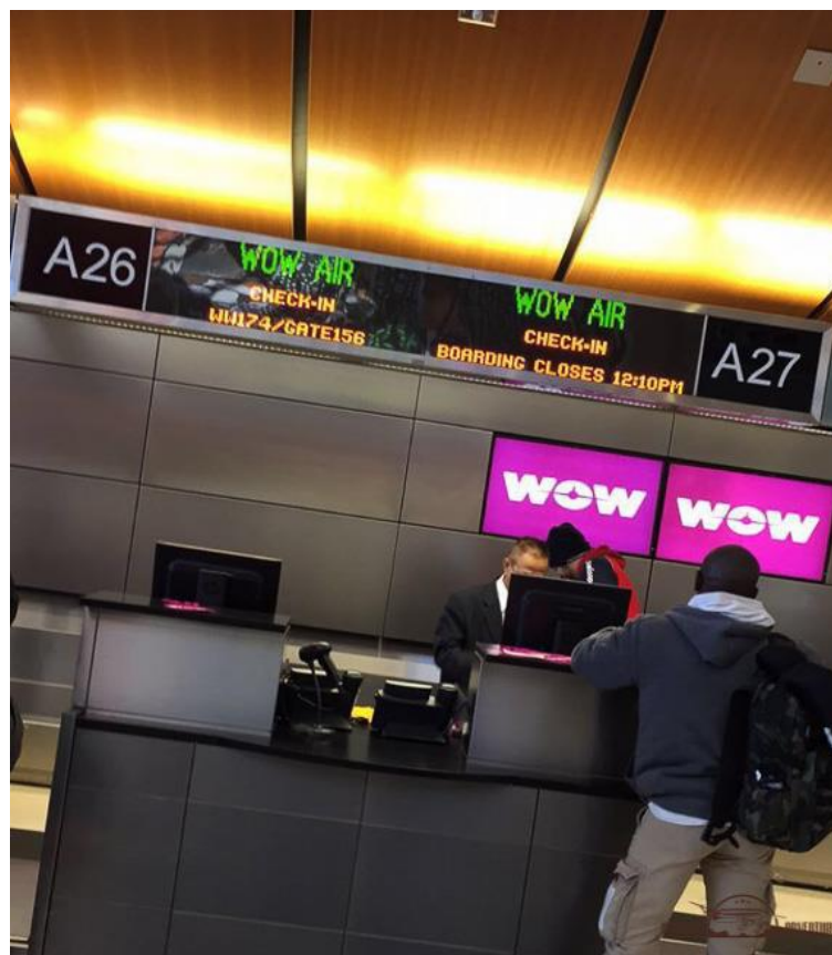
WOW Air LAX check-in

At LAX, WOW Air operates from the Tom Bradley International Terminal (TBIT). WOW Air does not have their own dedicated staff at LAX so ground services are contracted with Hallmark Aviation. The check-in counters are located in check-in area A. According to their website, the check-in counters open 2 hours before departure but in actuality, were open at least 3 hours before departure. I got to the check-in counter 3 hours before my 12:40 PM departure and the agents were already assisting passengers.