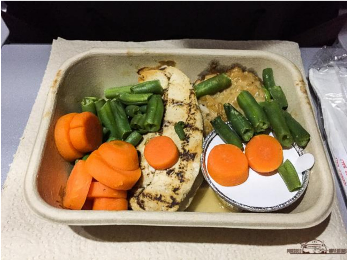
WOW Air chicken and risotto