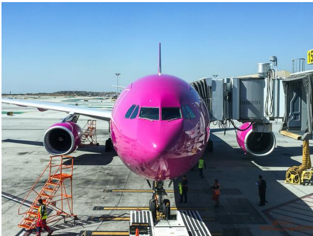
WOW Air A330 parked at LAX

However, I should add that the WOW Air Station Manager at LAX was awesome. Seeing that we were disappointed with our re-assigned seats, she proactively paged the passenger that was assigned to my selected seat and politely asked her to switch seats with us. Luckily, the girl didn't care and we were back to our original purchased seats. Fortunately, this worked out in this case but I don't know what would have happened if the girl said "no." Would WOW Air have to refund me for the seat selection fee if the seat selection was never honored? I'm no expert in this area but that has to be some sort of DOT violation right? Selling a service that is not honored later?